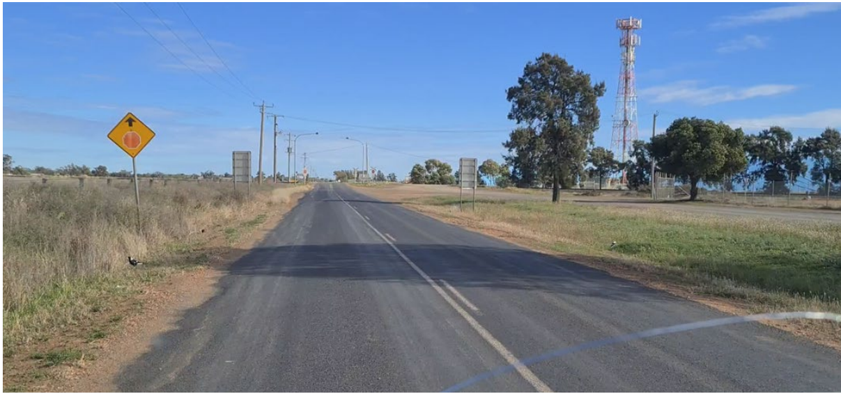
Stop Sign Ahead on Old Backwater Road, Narromine